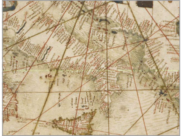
Part of the Catalan World Map, by courtesy of Biblioteca Estense Universitaria, Modena.