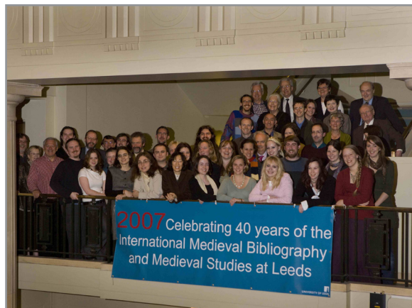
40th Anniversary Celebrations for the IMB and Medieval Studies at Leeds

castles, abbeys, landscapes, and settlements of Yorkshire itself are on the city's doorstep.